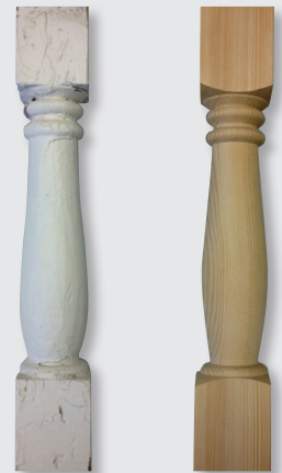
Historical Original Part

Whether it's a duplicate of a historical part or your own unique custom design, Crown Heritage can manufacture to your specifications.